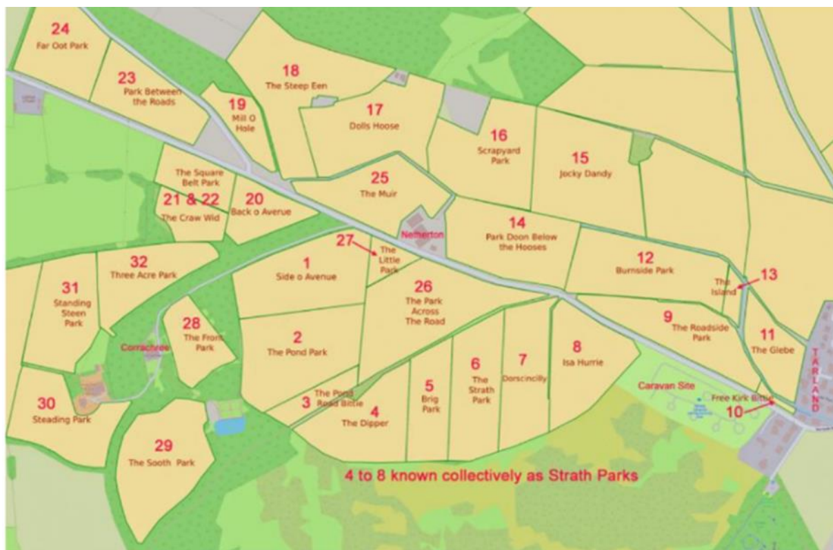
Map showing named fields as described in the numbered list below.

Based on QGIS Cloud Cromar Fields webpage.